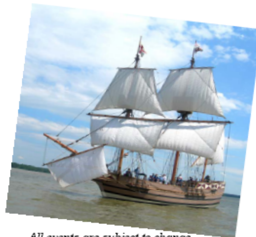
All events are subject to change

On this day, as they have for many years, the Order of Cape Henry will commemorate the erection of the cross and conduct a religious observance in the style of the first New World services of the Church of England.